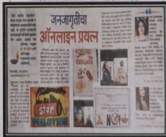
News of 'Anti Noise Pollution awareness campaign conducted on online and the same news published in Maharashtra Times a very popular newspaper