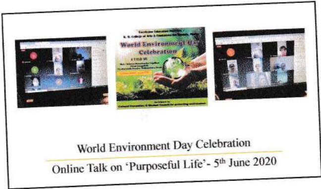
World Environment Day Celebration Online Talk on 'Purposeful Life' - 5 th June 2020