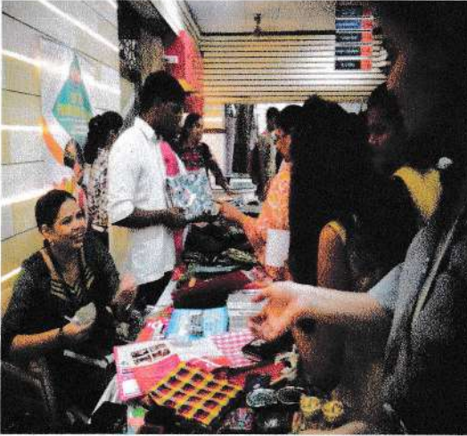
Exhibition of handmade products made by Disabled from Self Esteem Foundation, Airoli